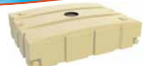
2000L Underdeck Tank 1785mm W x 2360mm L x 550mm H

Hide the tank under the house or deck the easy way!