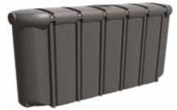
3500L Slimline Smooth 780mm W x 3020mm L x 1915mm H