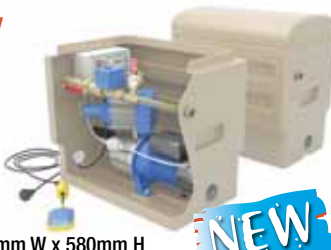
540mm L x 375mm W x 580mm H

Auto Mains Water Switching Device with the intelligence to switch between mains water & tank water as necessary.