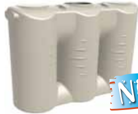
3000L Slimline Smooth 850mm W x 2470mm L x 2030mm H