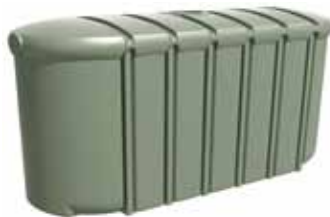
5000L Slimline Smooth 1160mm W x 3035mm L x 1960mm H

Hide the tank under the house or deck the easy way!