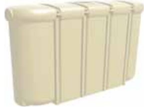
2500L Slimline Smooth 780mm W x 2510mm L x 1910mm H