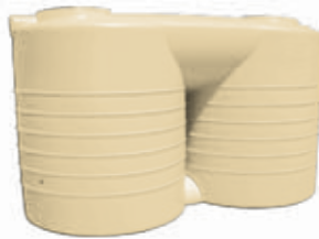
5000L Slender Stubby 1315mm W x 2680mm L x 1980mm H